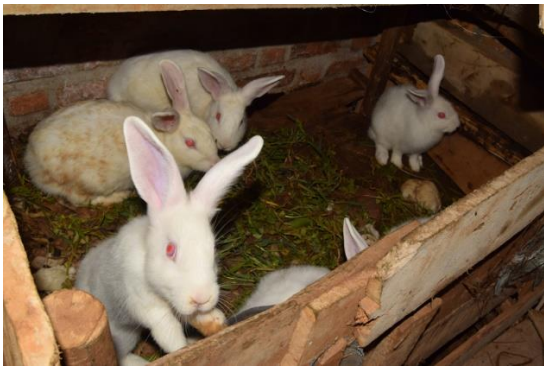
Young people from the center feed the rabbits