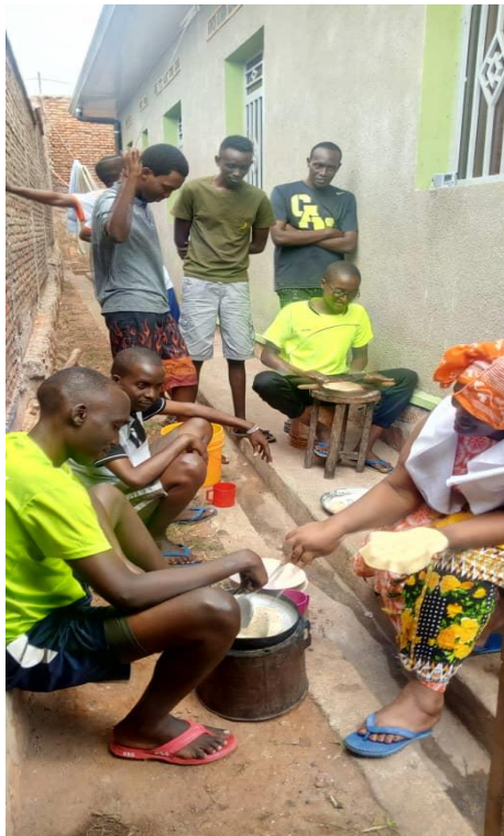
Learning the art of cooking