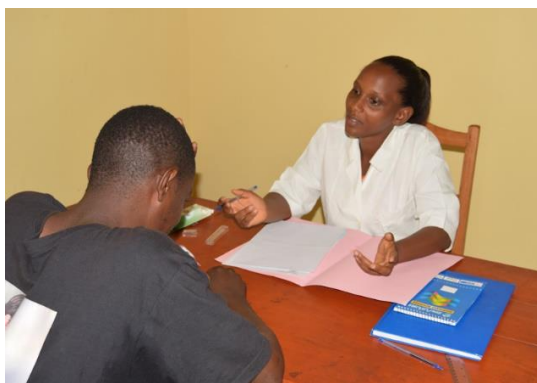
Medico-psychosocial support for young people