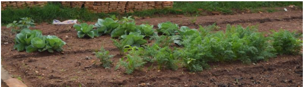
Vegetable gardens maintained by young people from the center