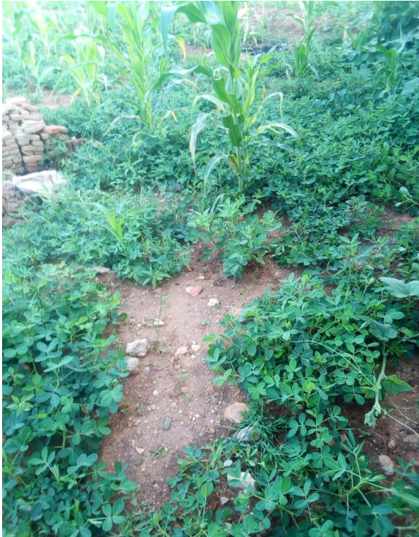
Corn, soy, peanut, and banana fields set up by young people supported through the “Bright Future Generation” center.